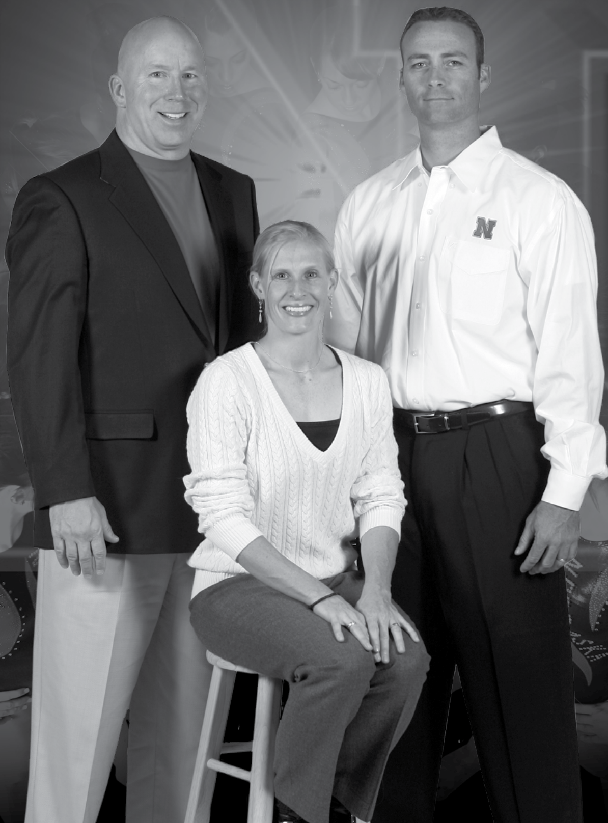
COACHES AND STAFF